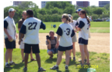
Photog Erik is awash in Camels!

Would it be too much to ask to arrive at our next game on a float like Apollo Creed in Rocky ?